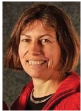
Mary Myers is a veteran media consultant with extensive experience in Africa. She has written five other papers for CIMA.

When many people think of Africa, they conjure an often atrocious record on press freedom: Eritrea is at the very bottom of Reporters Without Borders' (RSF in its French initials) 2014 World Press Freedom Index. Somalia is the second worst country in the world, after Iraq, for its high numbers of unsolved murders of journalists and ranks as the fifth-deadliest country in the world overall (56 journalists have been killed in Somalia since 1992). Sudan, Djibouti, and Equatorial Guinea are also near the bottom. 1 Ethiopia, Rwanda and Gambia rank near the top of all countries from which journalists flee, worldwide. 2 Two other forbidding spots on the African map are Swaziland and the Democratic Republic of Congo (DRC).